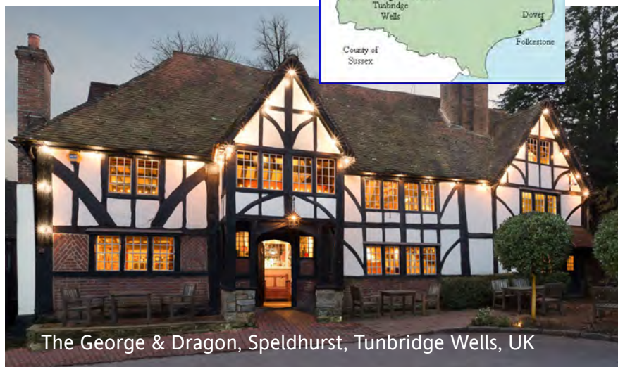
The George & Dragon, Speldhurst, Tunbridge Wells, UK