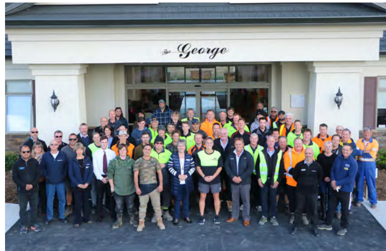
Scores of local businesses and subcontractors are part of the making of Speldhurst Country Estate